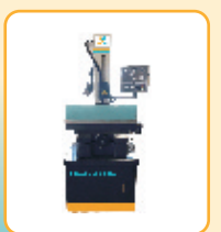
Advance EDM Drill