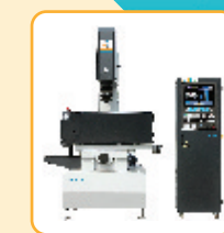
ELTECH - ESERIES