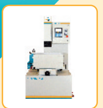
ELTECH - D280